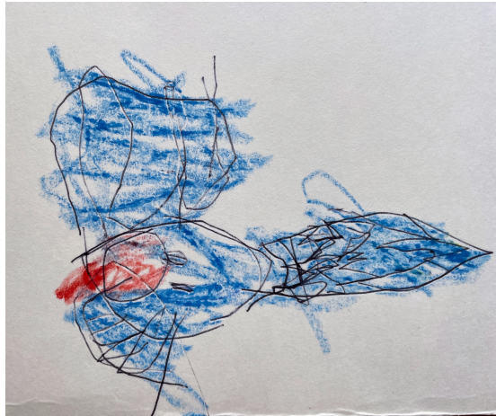
The Nice Dragon

The Queen Dragon jumped over the bunnies picnic basket and returned to work.